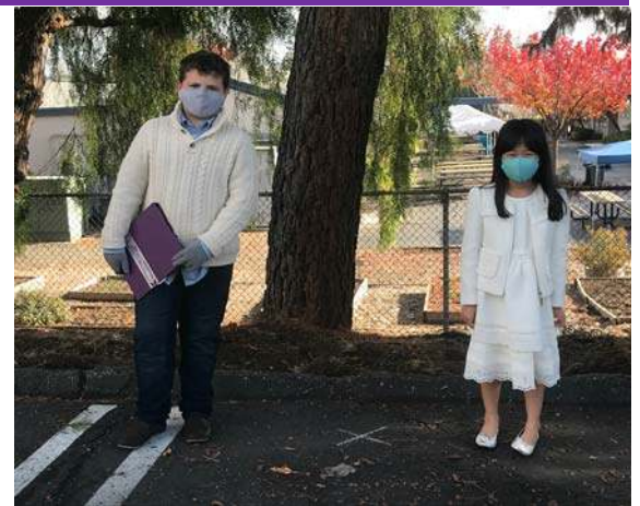
Our thanks to our 3 rd graders who served at our Children’s Mass.