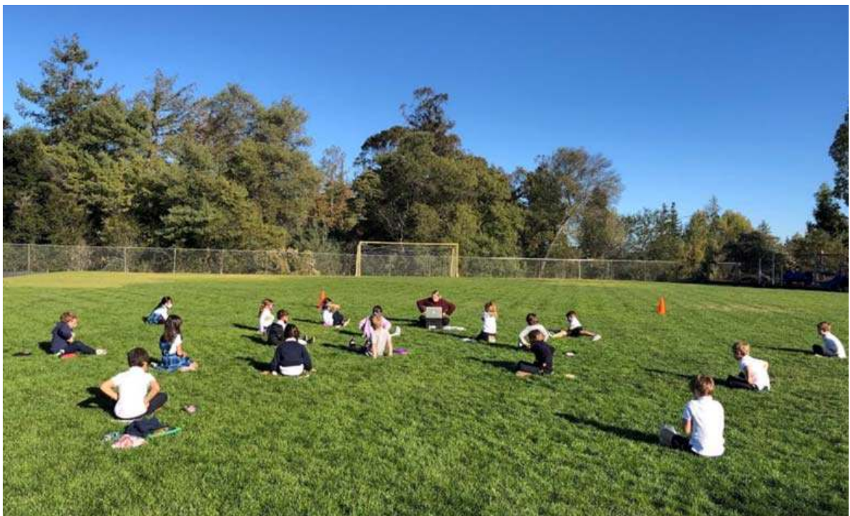
The St. Nicholas 1st-grade in class outdoors in our beautiful space!

St. Nicholas School is currently accepting applications for the 2020/2021 school year. For more information and a virtual tour, please see our website at: www.stnicholaslah.com