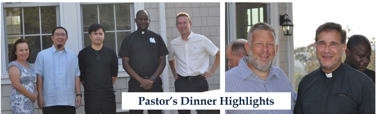
Pastor's Dinner Highlights